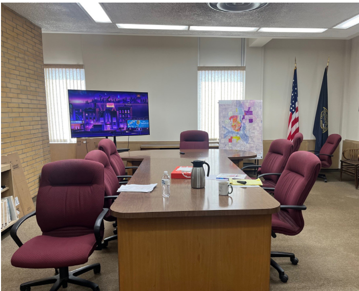
City Council meeting space has limited functionality