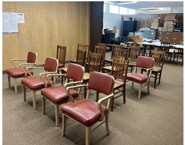
Public seating area is adjacent to work area and records