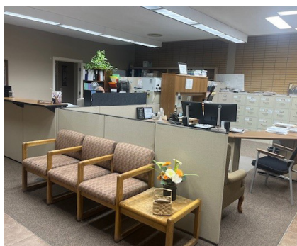
Human Resources Department